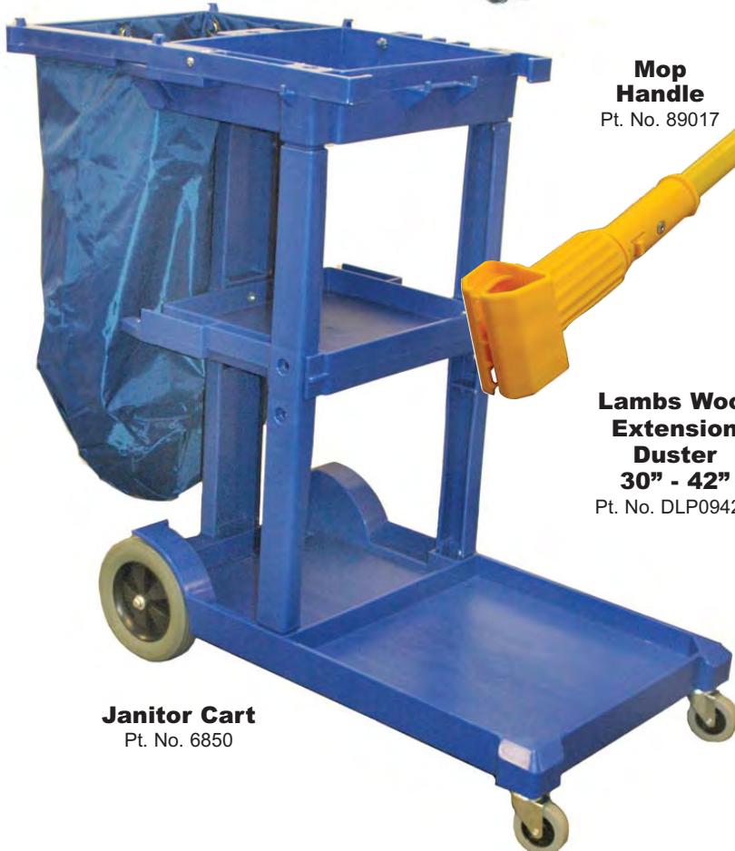
Janitor Cart Pt. No. 6850