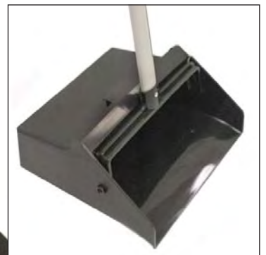
Lobby Dust Pan Pt. No. 96208