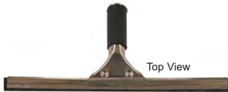
14" Window Squeegee Pt. No. PR35