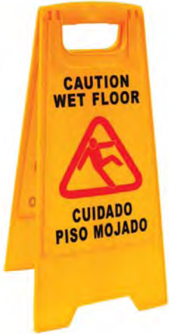
English/Spanish Wet Floor Sign Pt. No. 1203