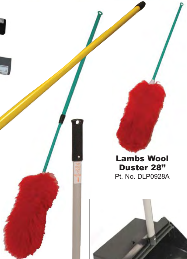
Lambs Wool Duster 28" Pt. No. DLP0928A